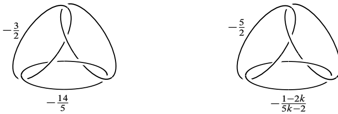
Figure 1: Surgery presentation for all (distinct) hyperbolic knots with two lens space fillings obtained by surgery on the minimally twisted 5–chain link

Given an orientable cusped hyperbolic 3–manifold M and a fixed torus component \tau of the boundary of its compactification, it is a consequence of Lackenby and Meyerhoff [20] that 8 is a universal upper bound for \Delta(\alpha_1, \alpha_2) for each exceptional pair (M, \tau; \alpha_1, \alpha_2) . The celebrated Gordon–Luecke theorem [16] can be formulated by saying that \Delta(S^H, S^H) = 0 , the cabling conjecture by saying that, as a maximum over an empty set, \Delta(S, S^H) = -\infty (see González-Acuña and Short [13]), the Berge conjecture implies that the Berge knots in [5] contain all exceptional pairs of type (S^H, T^H) , and the theorem of Gordon and Luecke [18] by saying that the knots realizing \Delta(\alpha_1, \alpha_2) = \Delta(S^H, T) are precisely the Eudave-Muñoz knots. The examples of exceptional (T^H, T^H) , (T^H, T) and (T^H, Z) pairs in Culler, Gordon, Luecke and Shalen [8], Gordon and Luecke [18] and Boyer and Zhang [7] are all obtained by surgery on 5CL, while the examples of exceptional (T^H, T^H) pairs in Dunfield, Hoffman and Licata [9] are not.